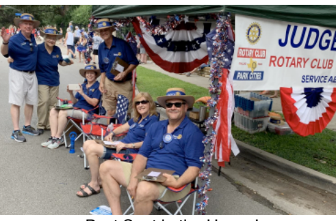
Best Seat in the House!