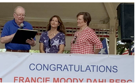
Our 2018 GM with UP and HP Mayors