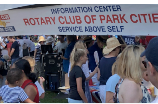
A Popular Place!

More on the website> Info> RCPC in Pictures